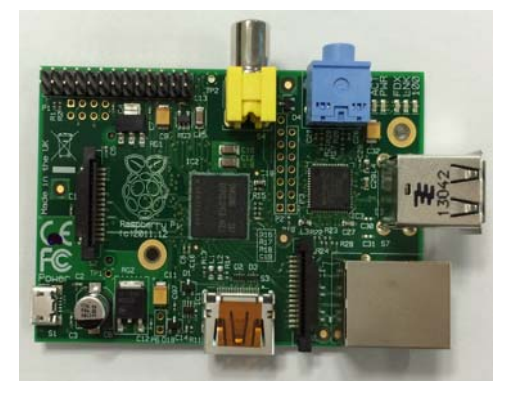
Figure 3. Raspberry Pi Agent device

When each bionic sensor around the driver starts to measure the health data, the aggregating device encodes the received data according to the IEEE 11073 standard which describes Associating, Configuring, Operating and Disassociating procedures.